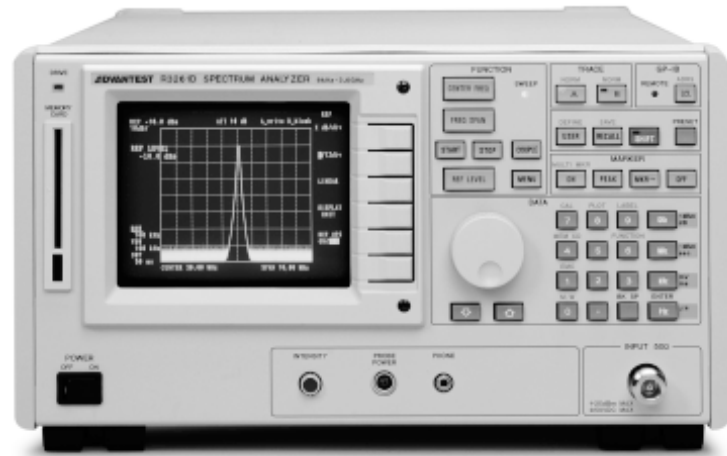
Used by NHK Japanese, Defense Agency