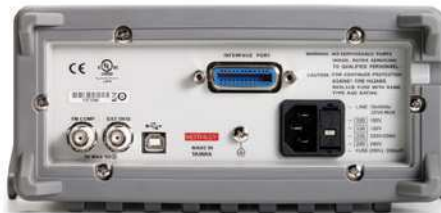
Model 2110 rear panel.

INPUT BIAS CURRENT: <30pA at 25°C. INPUT PROTECTION: 1000V all ranges (2W input). AC CMRR: 70dB (for 1kΩ unbalance LO lead). POWER SUPPLY: 100V/120V/220V/240V. POWER LINE FREQUENCY: 50/60Hz auto detected. POWER CONSUMPTION: 25VA max. DIGITAL I/O INTERFACE: USB-compatible Type B connection, GPIB (option). ENVIRONMENT: For indoor use only. OPERATING TEMPERATURE: 0° to 40°C. OPERATING HUMIDITY: Maximum relative humidity 80% for temperature up to 31°C. STORAGE TEMPERATURE: –40° to 70°C. OPERATING ALTITUDE UP TO 2000 M ABOVE SEA LEVEL. BENCH DIMENSIONS (WITH HANDLES AND BUMPERS): 107 mm high × 252.8 mm wide × 305 mm deep (3.49 in. × 9.95 in. × 12.00 in.). WEIGHT: 2.23 kg ( 4.92 lbs.). SAFETY: Conforms to European Union Low Voltage Directive, EN61010-1. Measurement Cat I 1000V and CAT II 600V. EMC: Conforms to European Union Directive 89/336/EEC, EN61326-1. WARRANTY: One year.